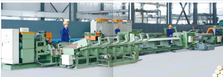
Lead-free brass ingot