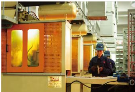
CAPTION FOUNDRY 铸造车间

Water meters and couplings Valves and fittings OEM Brass/Bronze/ Lead free parts ETP Copper Bus bar Brass/Bronze/ Lead free Ingots Brass/Bronze/ Lead free Rods Brass/Bronze/ Copper Coils/Strips Brass/Bronze/ Copper Sheets/Plates