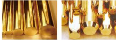
圆棒 Round Bar