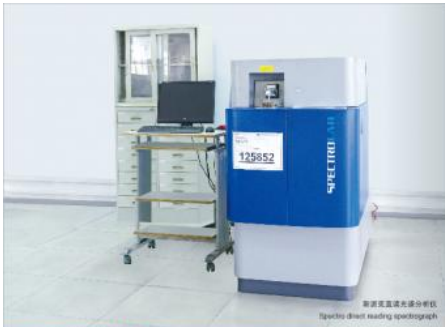
新谱直读光谱分析仪 Spectro direct reading spectrograph